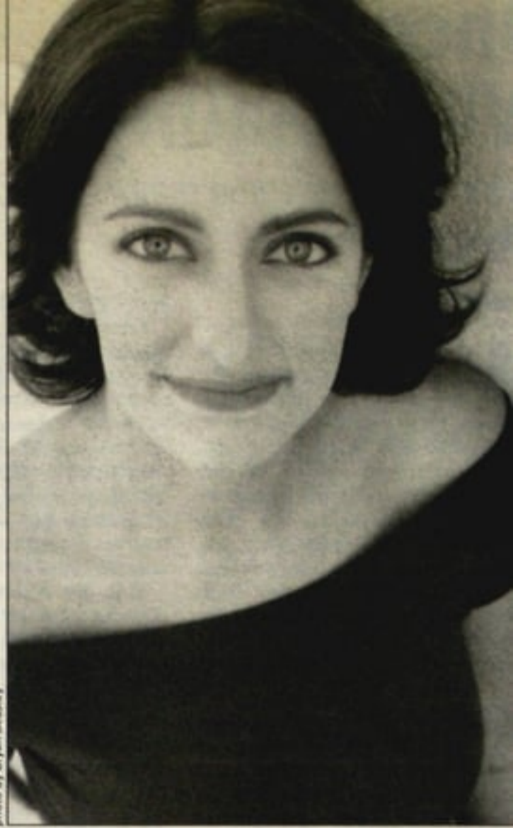
...and the after.